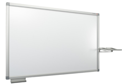
TeamBoard T4 Interactive Whiteboard with Laptop Shelf and Marker Tray

TeamBoard Academy provides a range of product knowledge, professional development, and technical training courses for administrators, tech managers, facility managers, and channel partners.