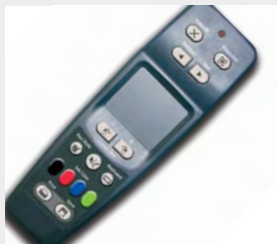
Engage your audience and control all panel applications with the remote control