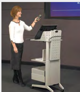
Walk-and-Talk Cordless Lectern