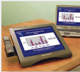
Walk-and-Talk 17" Interactive Panel