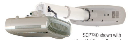
SCP740 shown with optional folding wall mount