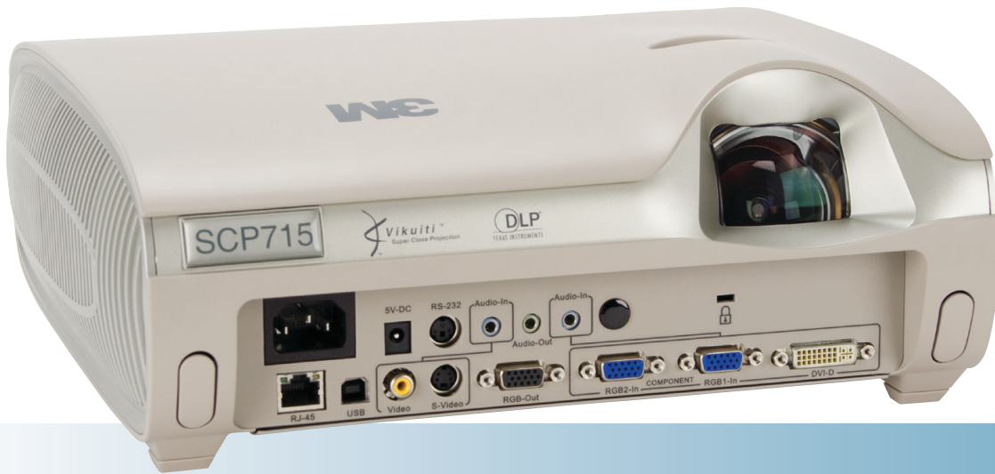
3M SCP715 Projector 78-9236-6937-4

Whether you're looking for bright and colorful projected presentations, or you have projection room space constraints, the 3M Super Close Projection System SCP715 is the ideal solution. Utilizing 3M's patented technology, you can display large images with this tabletop or ceiling mounted projector close to the screen, for the ultimate professional image.