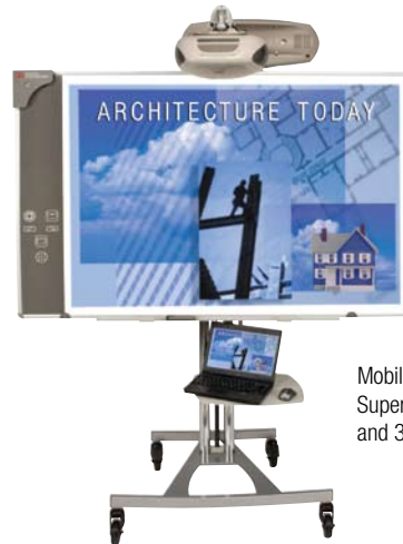
Mobile Stand shown with 3M™ Super Close Projection SCP712 and 3M™ Digital Board

Two (2) locking casters to prevent unwanted movement